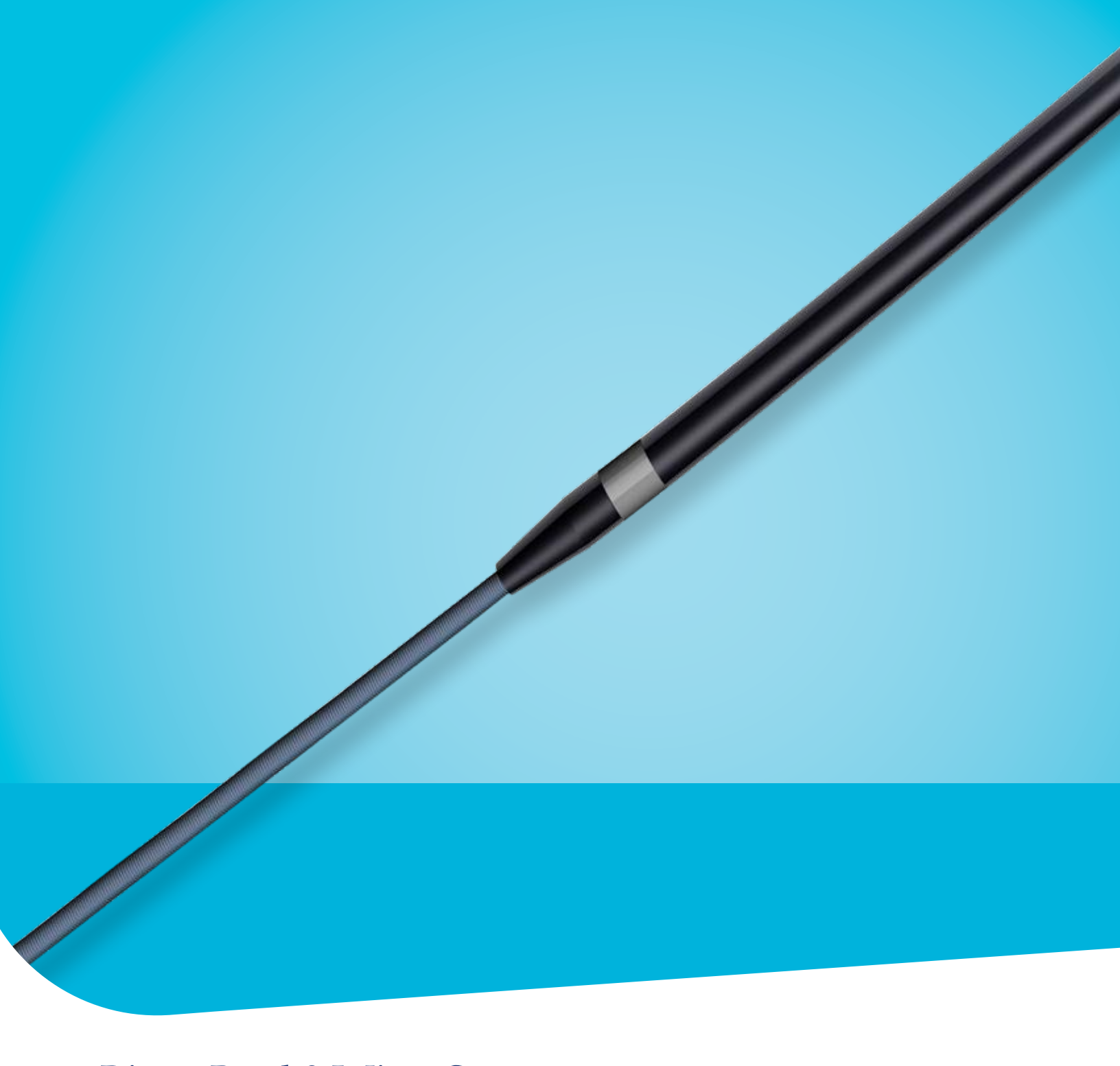
PiggyBack® Wire Converter Convert 0.014" Procedures Into 0.035" Possibilities